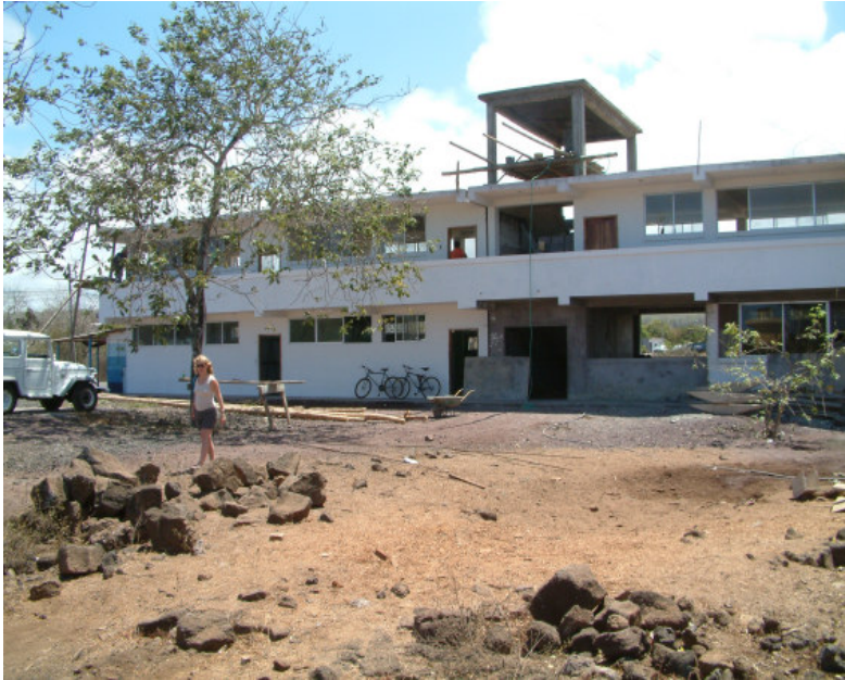
The building that will house the new laboratories