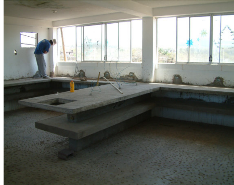
Refurbishment of the pathology laboratory in progress